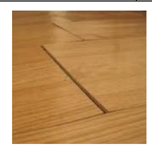
Laminate floor with damage, missing pieces or unfinished edges