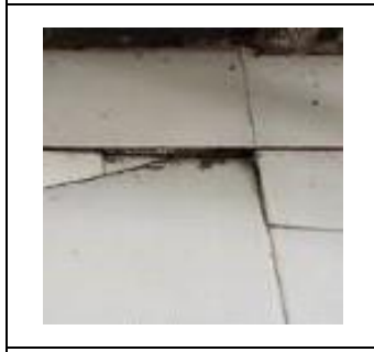
Damaged or uneven floors

Do you have any potential problems with your floors?