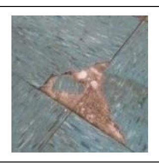
Vinyl with damage or lifted edges