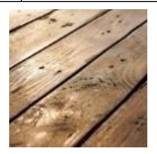
Damaged or uneven floorboards