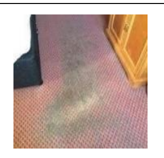
Internal steps between Damaged or threadbare carpets